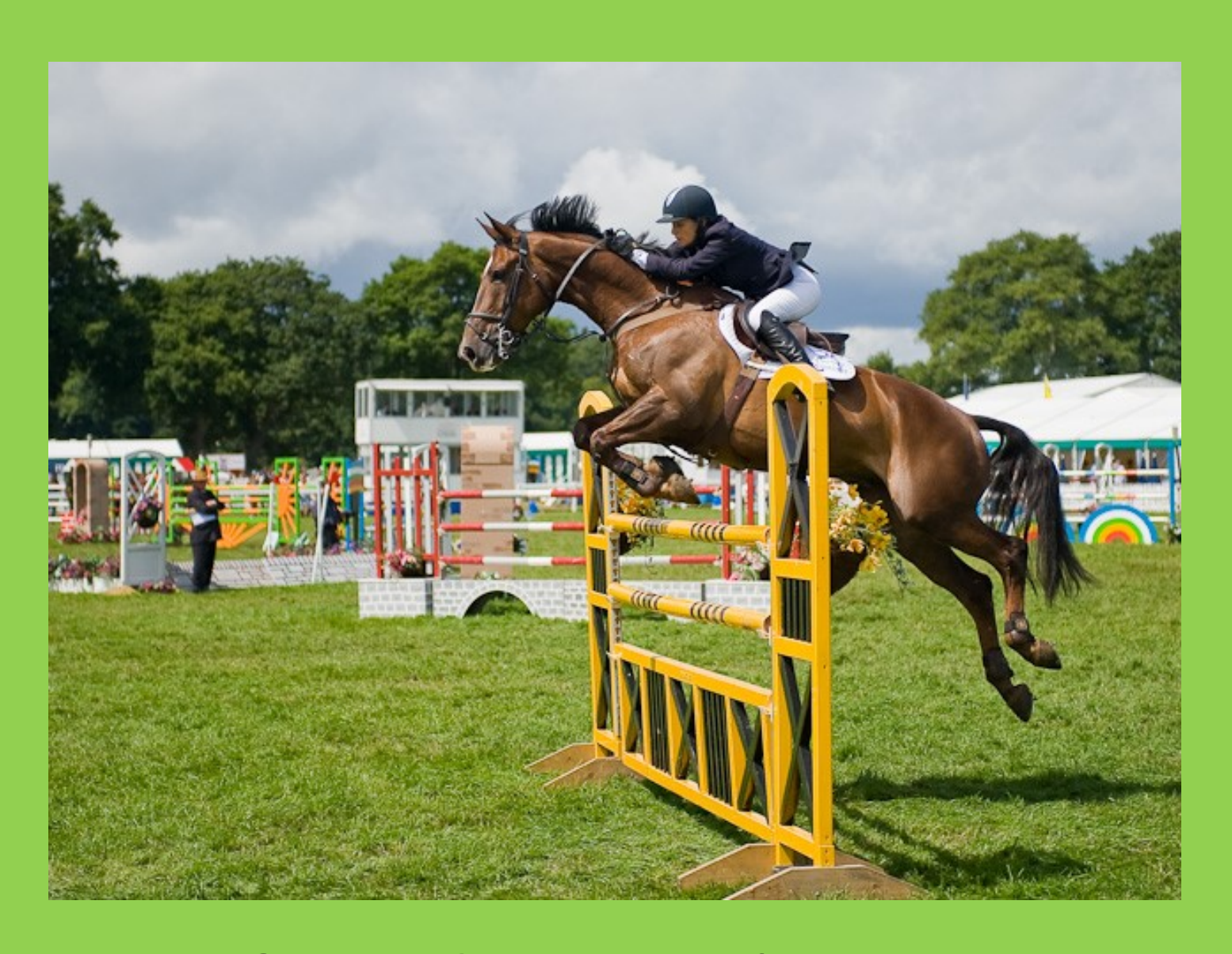
Show Jumping Program